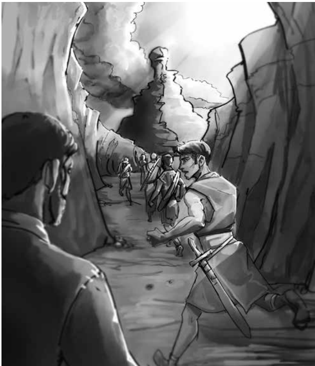
David flees to the wilderness to escape Saul's wrath.

Fill in the blanks using 1Samuel 24:4 to see how David's men responded to this situation: "And the men of David said unto him, _____ the day of which the _____ said unto you, _____, I will deliver your _____ into your _____, that you may do to him as it shall seem good unto