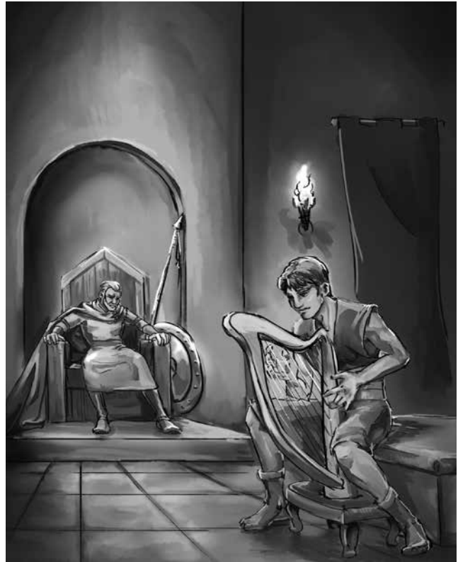
David plays the harp in Saul's court to soothe the king.

Saul reacted to David with a carnal, selfish and even hateful attitude. The Prophet Samuel had told Saul that he would