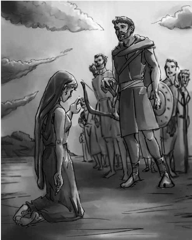
Abigail uses great wisdom to assuage David's wrath.

the words of your _____. Let not my _____, I pray you, regard this man of Belial, even _____: for as his name is, so is he; _____ is his name, and _____ is with him: but I your _____ saw not the young men of my _____, whom you did send. Now therefore, my _____, as the LORD lives, and as your soul lives, seeing the LORD has withholden you from coming to _____, and from _____ yourself with your own hand, now let your enemies, and they that seek evil to my lord, be as _____. ”