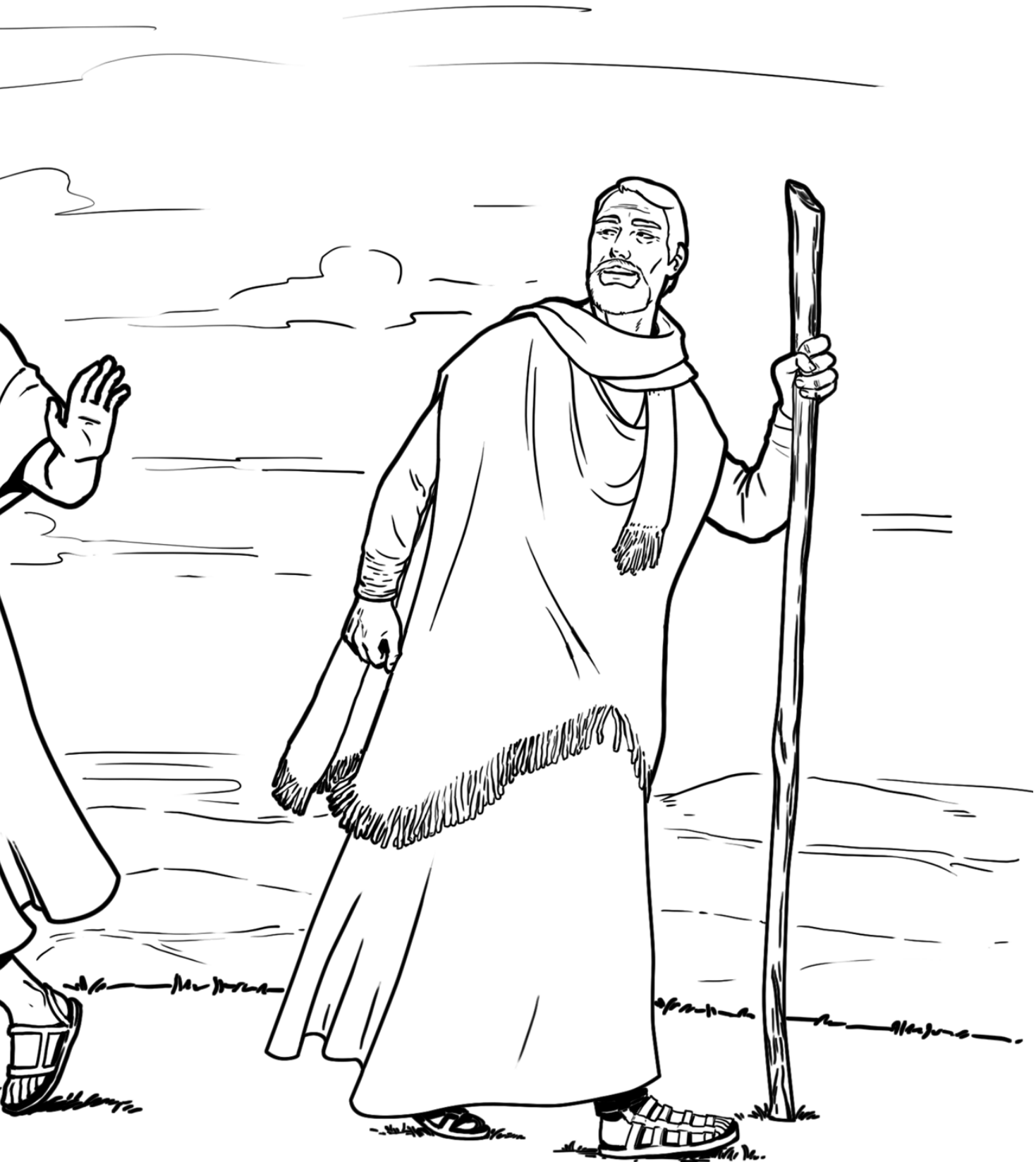
Lot and Abram part ways.