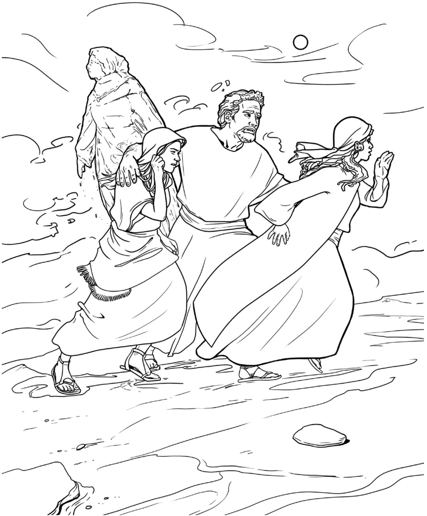
Lot's wife looks back and turns into a pillar of salt.