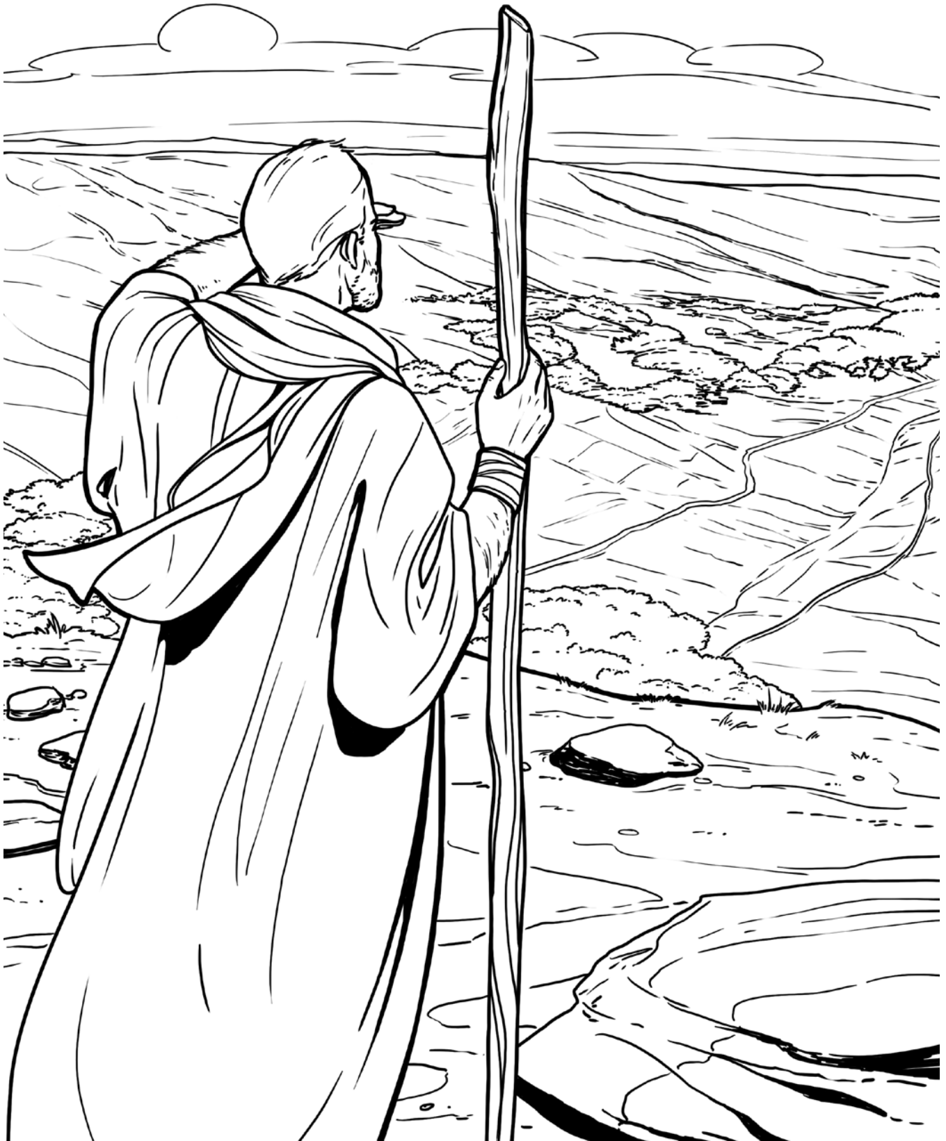
Abram looks out over the land God has promised him.